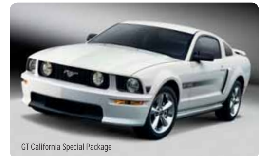
GT California Special Package