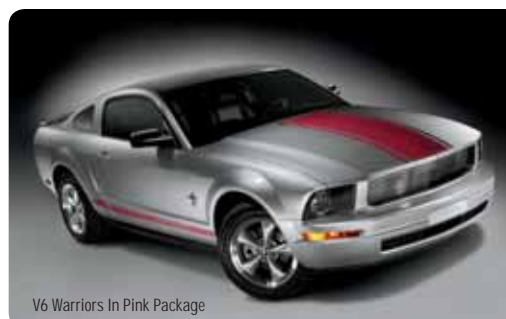
V6 Warriors In Pink Package