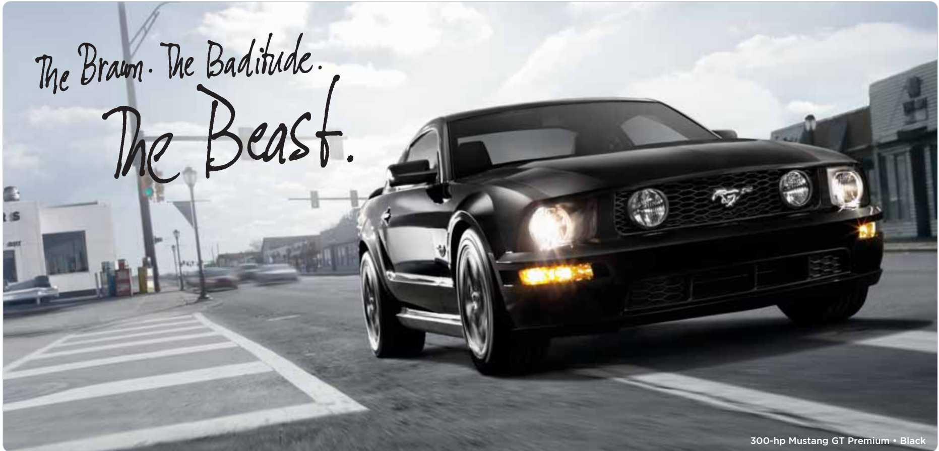
300-hp Mustang GT Premium • Black