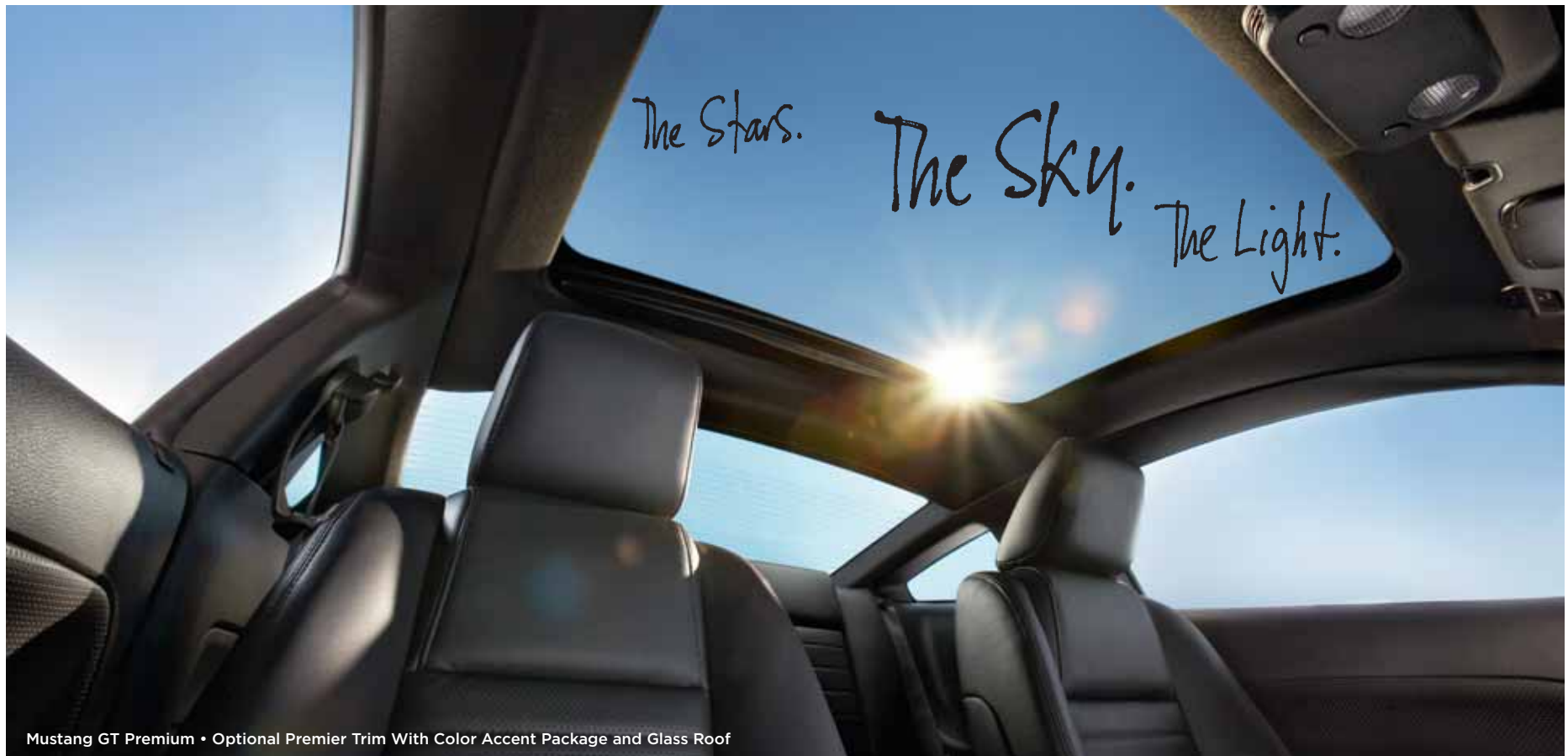
Mustang GT Premium • Optional Premier Trim With Color Accent Package and Glass Roof